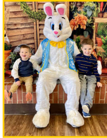
Brunch with the Bunny!

The event was attended by nearly 50 residents who engaged in lively discussions with the Township officials. Plans are underway for future events.